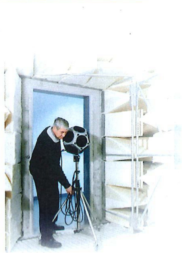
HLFU Wiesbaden - Fully-Anechoic Chamber f_u \leq 100 Hz