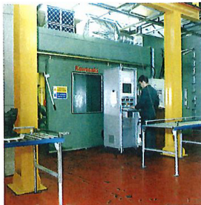
Kawasaki - Noise Lock enclosure for precision machinery