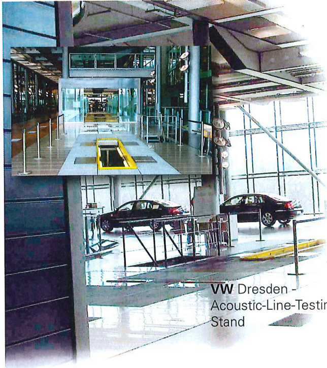
VW Dresden - Acoustic-Line-Testing-Stand