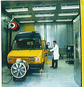
DAF - Noise Lock-Test-stand enclosure