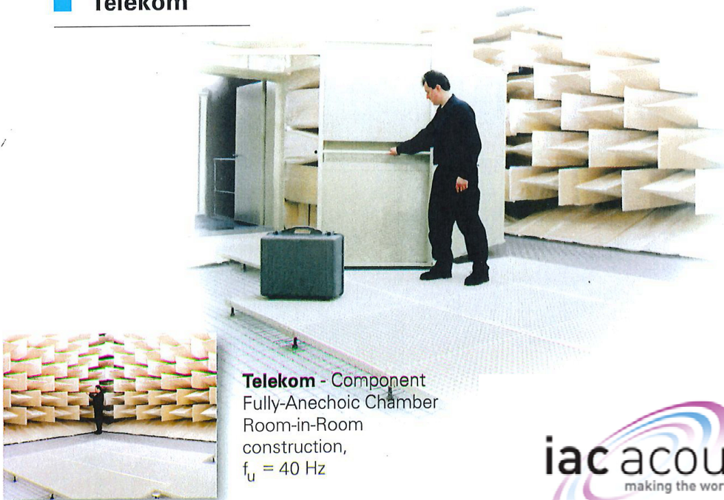
Telekom - Component Fully-Anechoic Chamber Room-in-Room construction, f_u = 40 Hz