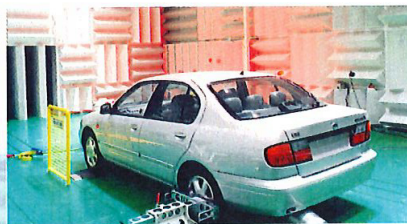
Tennex - automotive test facilities, ambient noise level = 35 dB, turn key project