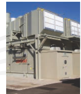
Gas turbine acoustic container package