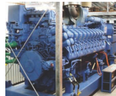
Acoustic diesel generator enclosure

In recent years we have acquired some of the best exhaust manufacturers worldwide including GT Exhaust, Maxim, Silex, Boet-Stopson and Colpro. These product ranges now mean we are able to offer the widest possible choice to our customers and enhance our relationships with end users through our local sales support network. If the need arises, we can always engineer a bespoke solution to a particular noise problem. We've been around for over 60 years as a group and some of our acquired organisations have been established even longer, so rest assured that you're in good company.