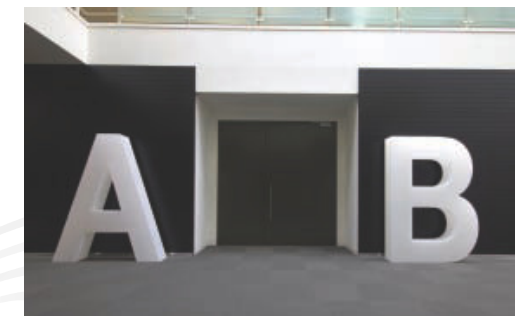
Double acoustic doorset installed at IMG

Our range of acoustic products for commercial buildings can be used individually or as part of a complete package to minimise noise. Air handling systems can be quietened using our comprehensive range of duct silencers to reduce the noise from fans, chillers and pumps. Mechanical plant can also be shielded using barriers and acoustic louvred screens. These products not only serve a functional purpose, but are also aesthetically pleasing. Noise-lock™, our range of acoustic doors and windows is the ideal solution to shielding unwanted noise or containing sound within a room or space whether they be for internal or external use, architectural or industrial. Complementing our doors and windows is Moduline™, our range of acoustic construction panels to ensure an effective acoustic performance between rooms.