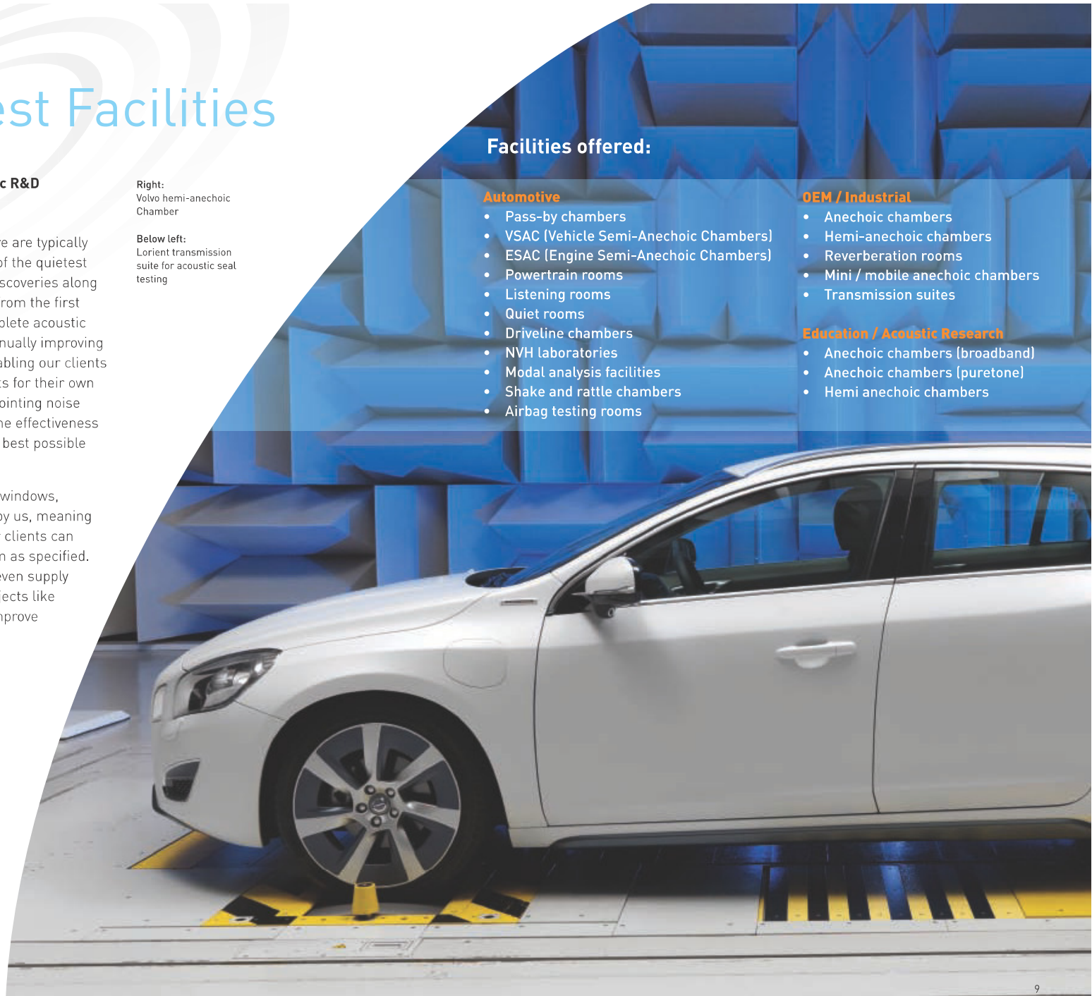
Below left: Lorient transmission suite for acoustic seal testing