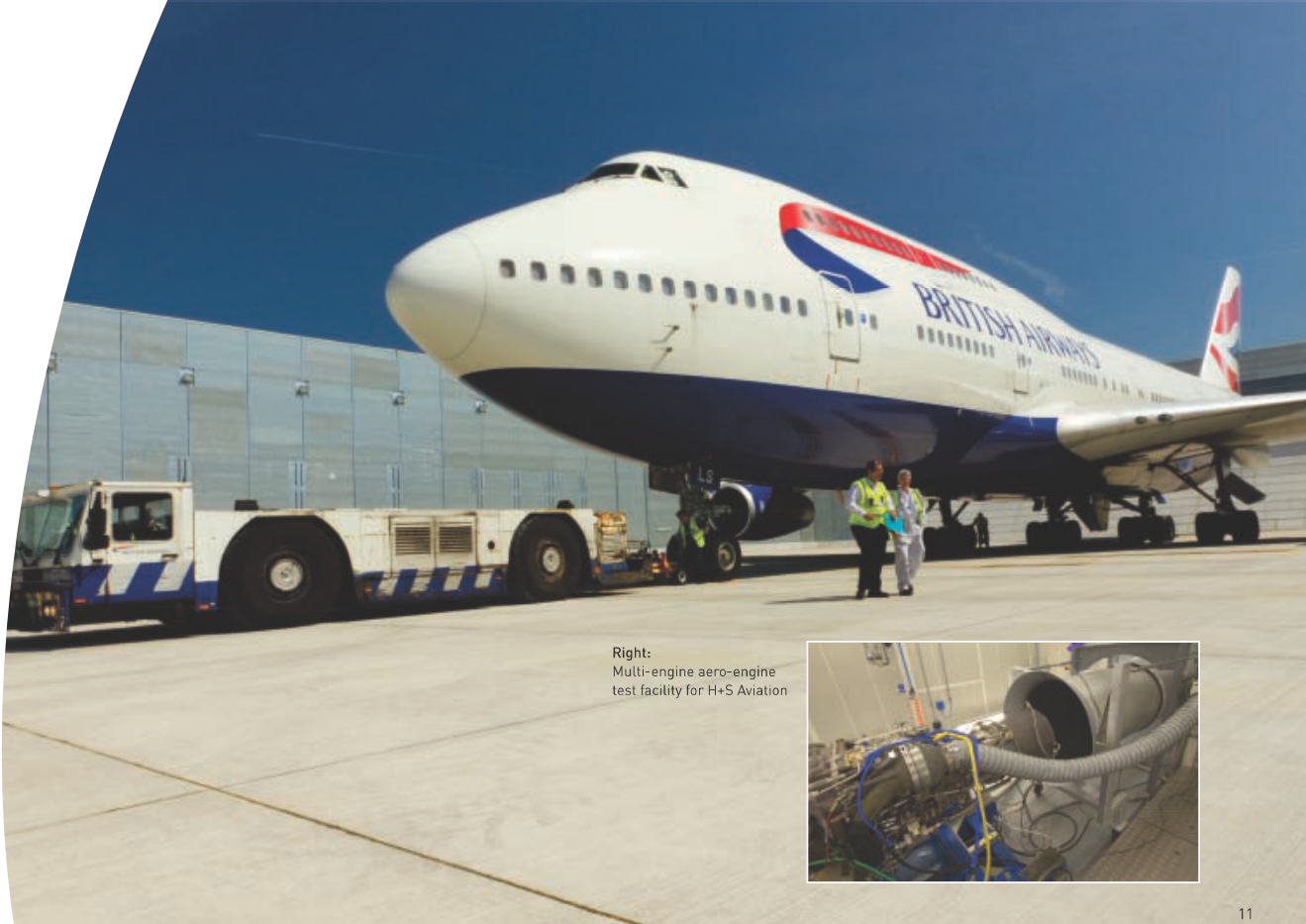
Right: Multi-engine aero-engine test facility for H+S Aviation